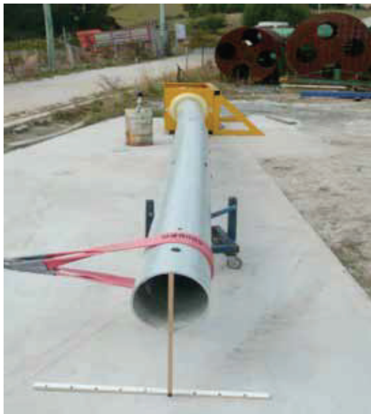
Fig 3. – Pole at 8 kN

Once the load reached 1,600 kg, it was held for 2 minutes and then released for inspection. No deformation of the pole was noted however approximately 100 mm of tip deflection was apparent due to compression of the Polecrete.