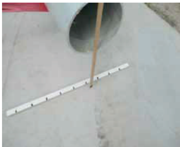
Fig 2. – Deflection at 8 kN

With a tip load of 8 kN, the pole deflected 390 mm which is very close to the 5% cantilever height ( 0.05 \times 7.9 \text{ m} = 395 \text{ mm} ). There was considered to be negligible deflection in the Polecrete base at this load.