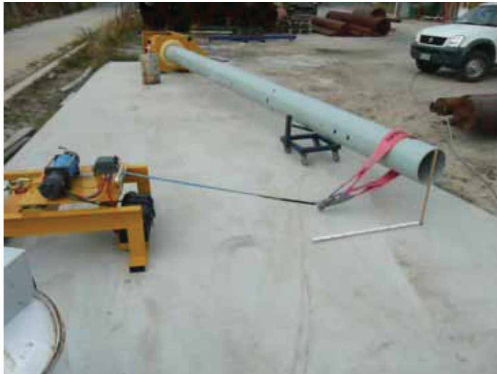
Fig 1. Pole Test Rig

The pole was potted in Polecrete (4 lb/cu.ft.) inside the steel clamp. The two-piece joint was engaged for a length of 670 mm and thru-bolted with an M20 bolt torqued to a firm tension. The bolt axis was horizontal to present the worst case load scenario for the horizontal test. The pole centreline height was 480 mm above ground line and a tip support trolley was provided. The tip load was applied 300 mm from the pole top via a 5t winch and load-cell.