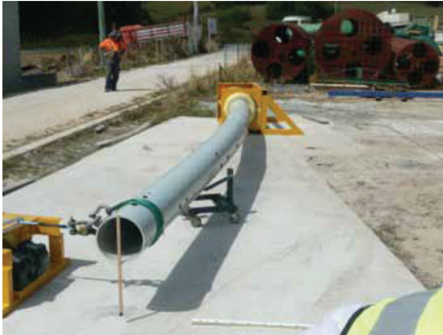
Fig 4. – Pole at 25 kN Tip Load